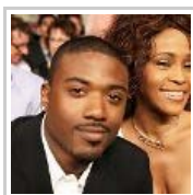
Ray J to Whitney Houston: 'I Miss You Nippy' (The Hollywood Reporter)