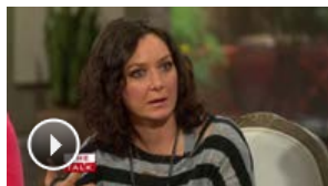
Sara Gilbert Breaks Down on 'The Talk'