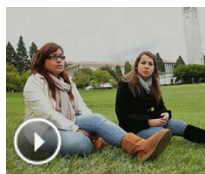
THR's Women in Entertainment Mentoring Program