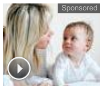
Teaching Your Baby How To Speak [Health Guru]