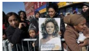
Whitney Houston Funeral: Fans and Loved Ones Honor the Legendary Star