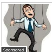
5 Signs You May Have Hypoglycemia (HealthCentral.com)