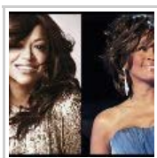
About Last Night: Whitney Houston and 'X Factor's' Stacy Francis Clash at Pre-Grammy Party (The Hollywood Reporter)