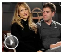
Mark Duplass and Lynn Shelton 'Your Sister's Sister' Sundance