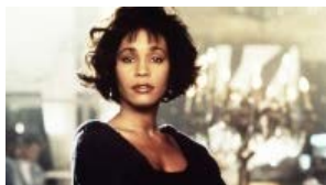
Whitney Houston 1963-2012: The Iconic Singer's Life and Career in Pictures