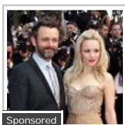
Rachel McAdams: I'm Never Apart from Michael Sheen for More Than Three Weeks (iVillage)