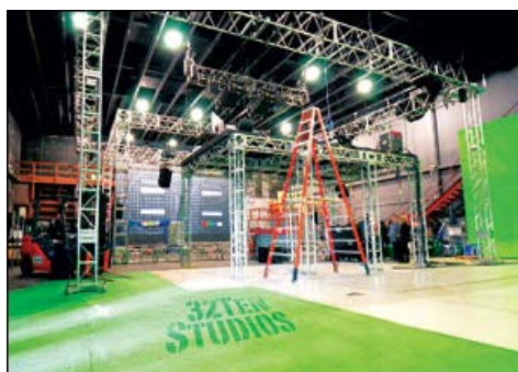
Effects aficionados should be happy to know that the San Rafael facility once owned by ILM, now called 32Ten.

A handful of other production-related companies also have offices in Building C, including the commercial production entity GB Films, which recently enlisted 32Ten to rig a mechanism to launch a computer server off a building for a web video.