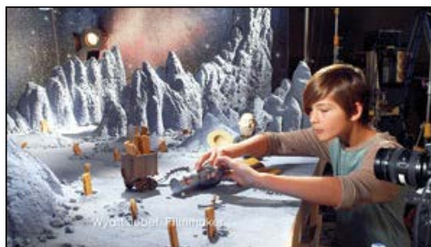
The shop continues to work on stop-motion work in its model shop.