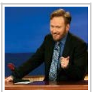
Conan O'Brien Still Angry at NBC, Makes Nazi Metaphor