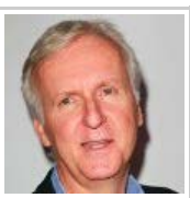
James Cameron: Why 'Avatar 2' 3D Will Be Better Than the Original