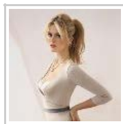
Brooklyn Decker's Model-to-Actress Career Challenge