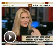
Ann Coulter Gets Censored on Live TV