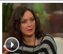
VIDEO: Sara Gilbert Breaks Down on 'The Talk'