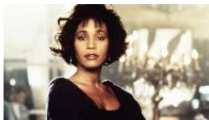
Whitney Houston 1963-2012: The Iconic Singer's Life and Career in Pictures