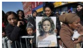
Whitney Houston Funeral: Fans and Loved Ones Honor the Legendary Star