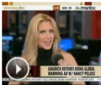
Ann Coulter Gets Censored on Live TV