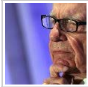
Rupert Murdoch Announces Sun on Sunday Launch for Feb. 26 (The Hollywood Reporter)