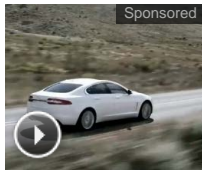
The Jaguar XF: Escape The Everyday [Jaguar]