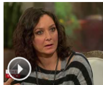
VIDEO: Sara Gilbert Breaks Down on 'The Talk'