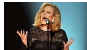
The Best (and Worst) Moments of Grammys 2012