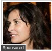
Demi Moore's Story Gets Even More Sad With Nitrous Oxide Rumors (The Stir By CafeMom)