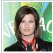
Linda Evangelista Breaks Her Silence On Paternity Suit Against PPR CEO Francois-Henri Pinault (The Hollywood Reporter)