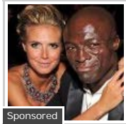
Heidi Klum Breaks Her Silence on Split from Seal (iVillage)