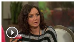
Sara Gilbert Breaks Down on 'The Talk'