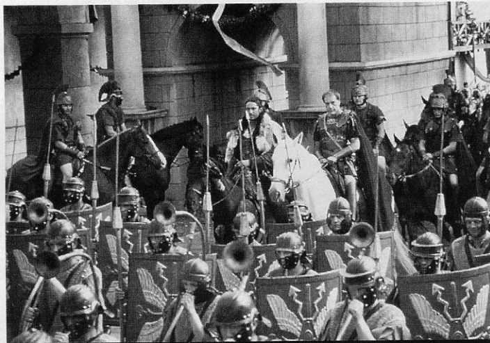
EPIC SCOPE: USA’s “Attila” boasted lavish staging in part due to a strong filmmaking tradition in Lithuania.