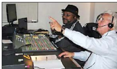
Di Bona directing an episode.