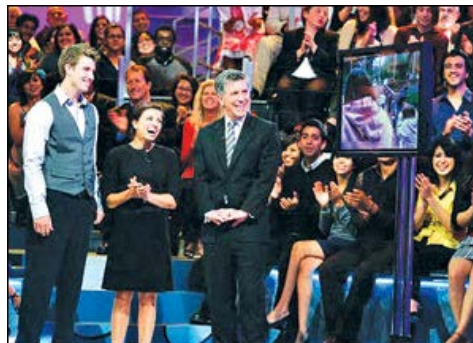
'AFV' host Tom Bergeron with studio audience members participating in one of games involving guessing what will happen in the clip that pepper the broadcast.