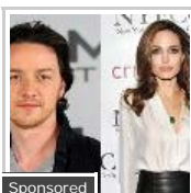
Kissing Angelina Jolie Was 'Awkward, Sweaty, And Not Very Nice'