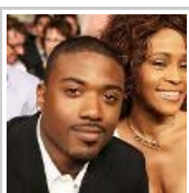
Ray J to Whitney Houston: 'I Miss You Nippy'