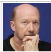
Paul Haggis Speaks Out on Scientology for First Time : 'I Was in a Cult for 34 Years'