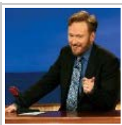
Conan O'Brien Compares NBC to Nazis