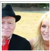
Hugh Hefner Reveals Age He Lost Virginity in NY Times