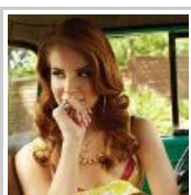
Hear Lana Del Rey Channel Shirley Bassey in 2010 Recording (Audio)