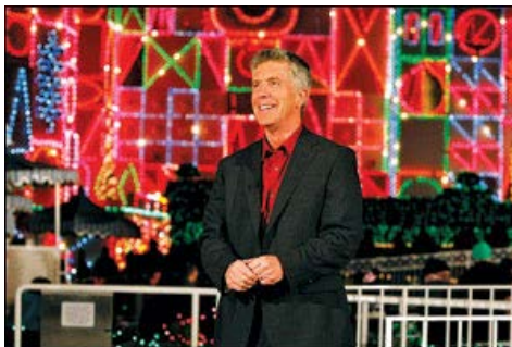
'AFV' host Tom Bergeron taping a Christmas show at Disneyland.